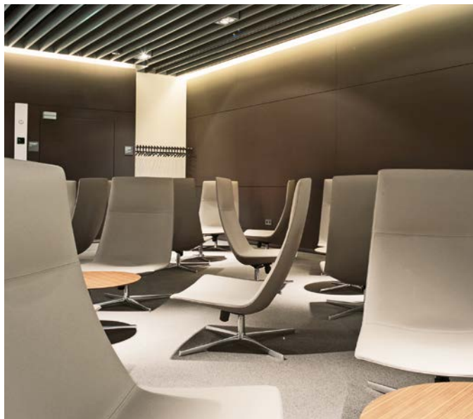
1 Hamilton Grange Teen Center New York Public Library NYC, USA Art. 2011