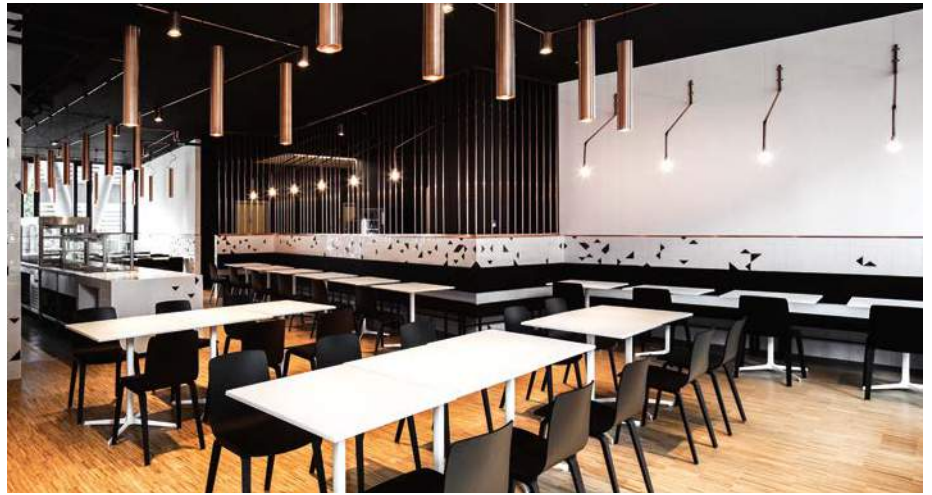
1 Bistro Luna Sofia, Bulgaria Art. 3910 Art. 0965 Fred