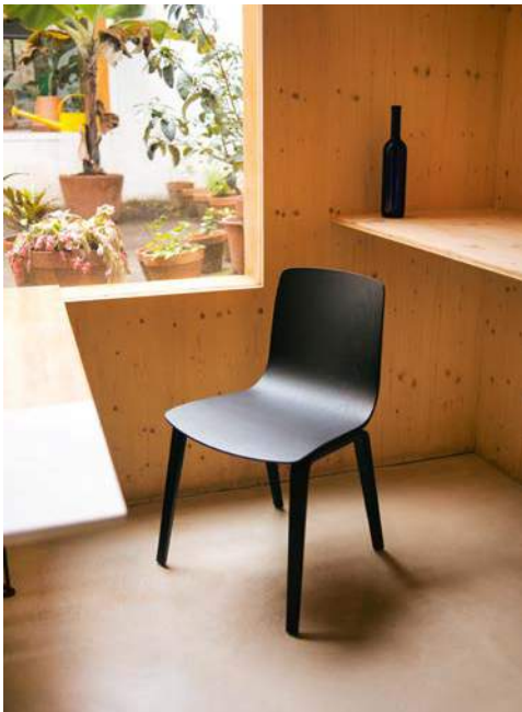
4 Art. 3910